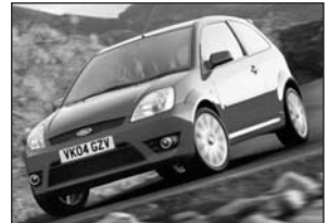
FordFiesta FordFiesta 1976-1989 (A0) / FordFiesta 1989-1996 (C0) / FordFiesta 1995-2001 (D0) FordFiesta/Fusion 2001- (C0K)

Match the customers vehicle to a starting page reference in the Vehicle Index, you will see a chapter page like the one shown here e.g Fiesta.